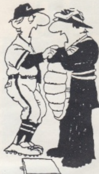
Give 'em hell Pete!