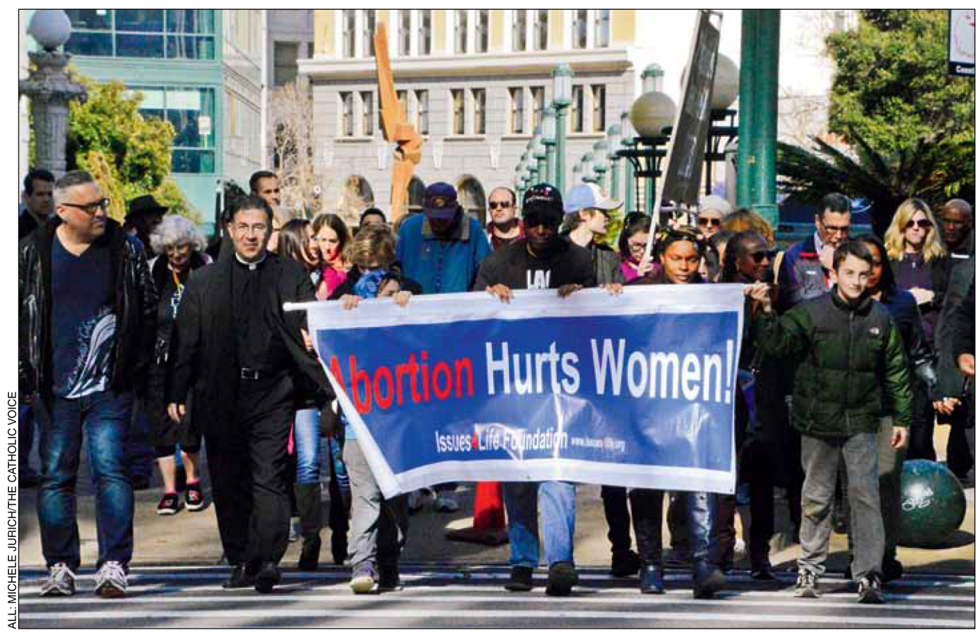
After a rally in front of Oakland City Hall, the StandUp4Life group begins its march through downtown Oakland. More photos at facebook.com/TheCatholicVoice.