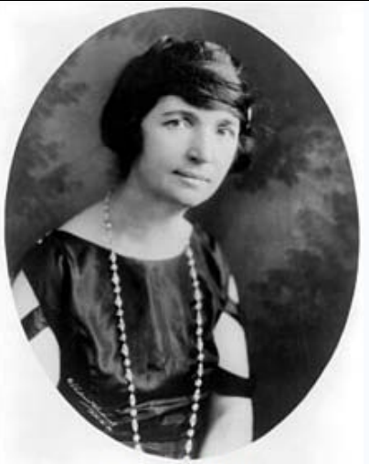
Sanger in 1922

Planned Parenthood was founded by a racist, white woman.